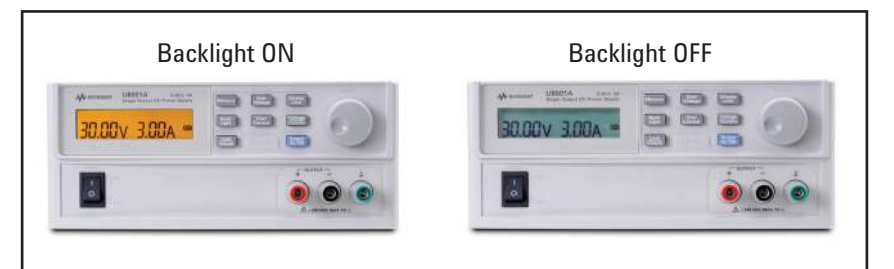
Figure 2. Backlight on/off options for LCD display