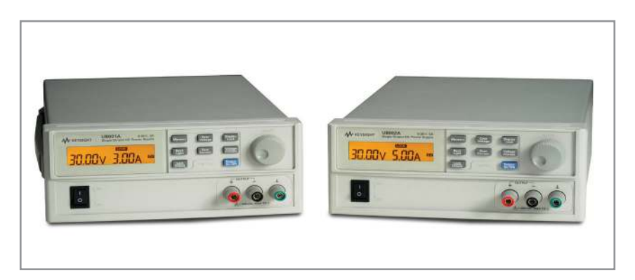
Figure 1. The U8001A 90 W and U8002A 150 W single output DC power supplies